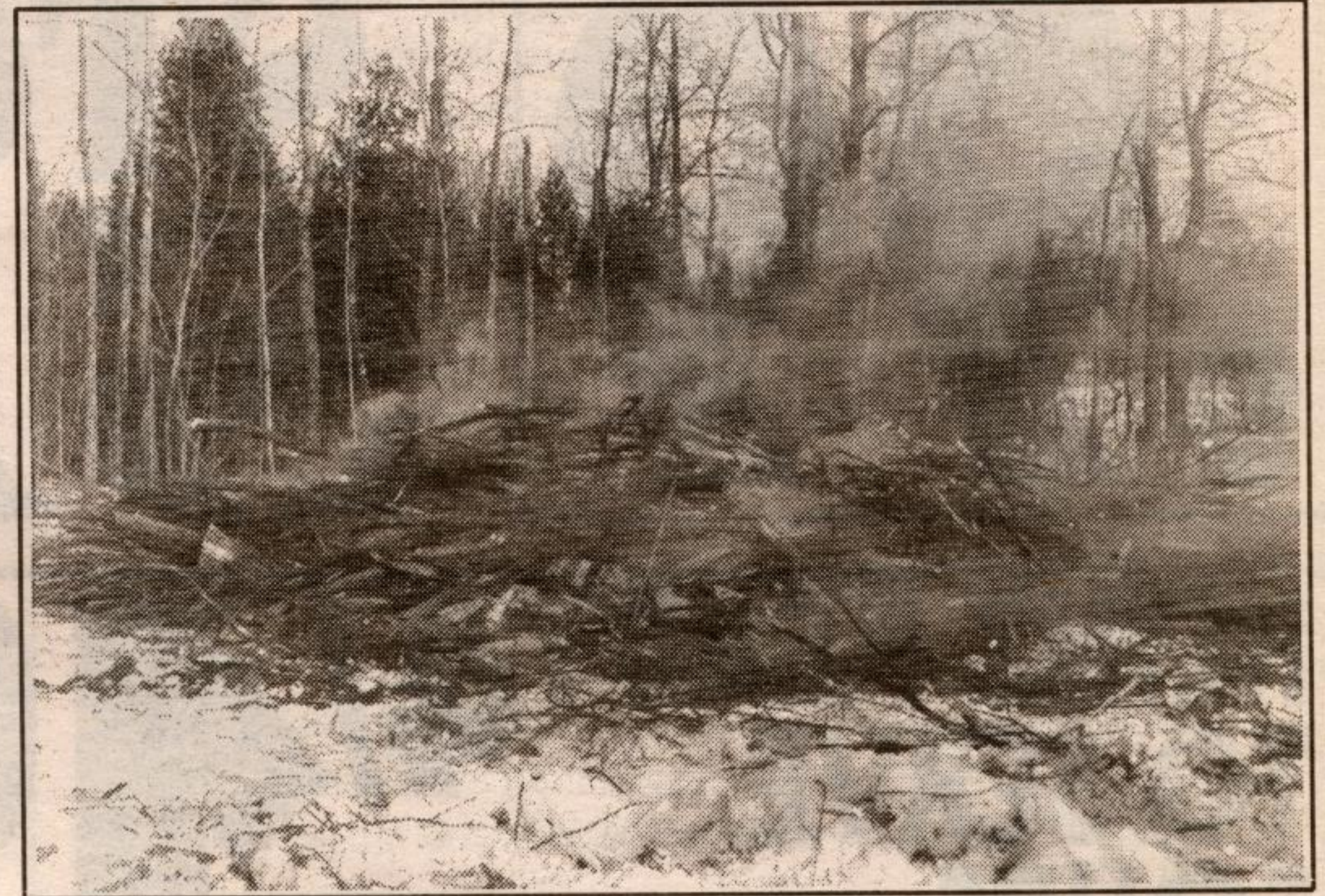
Last Wednesday trees on a piece of the Acton quarry land, owned by United Aggregates Limited, were burned to clear the land for mining purposes. Third Line residents are upset an amendment to preserve treed areas has not yet been examined by the Niagara Escarpment Commission.

The group, which started in 1988, will also lobby for the enforcement of rules and regulations in terms of licences and site plans.