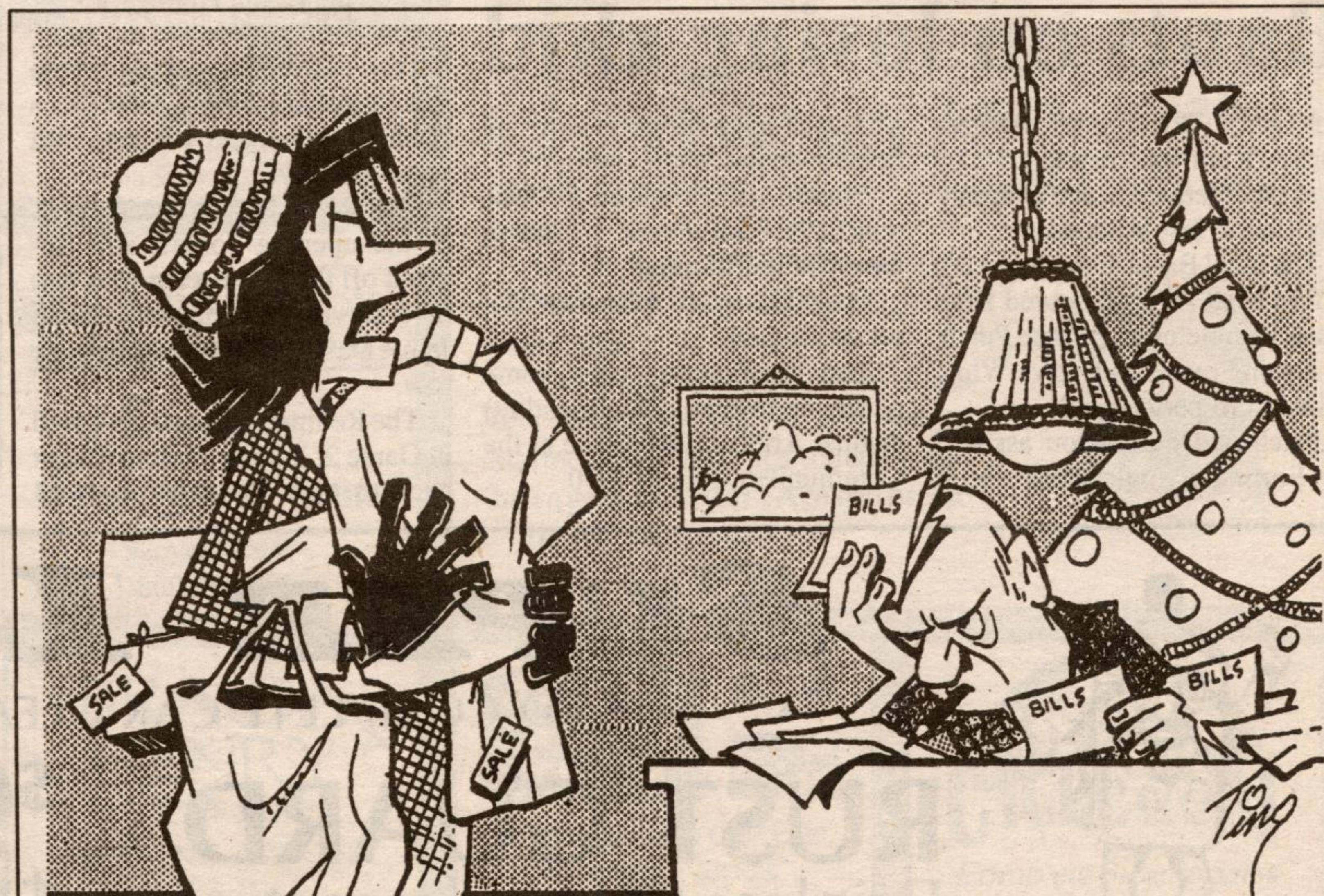
"THE COUNTRY'S BILLIONS IN DEBT AND YOU GO APE OVER AN $82 OVERDRAFT?"