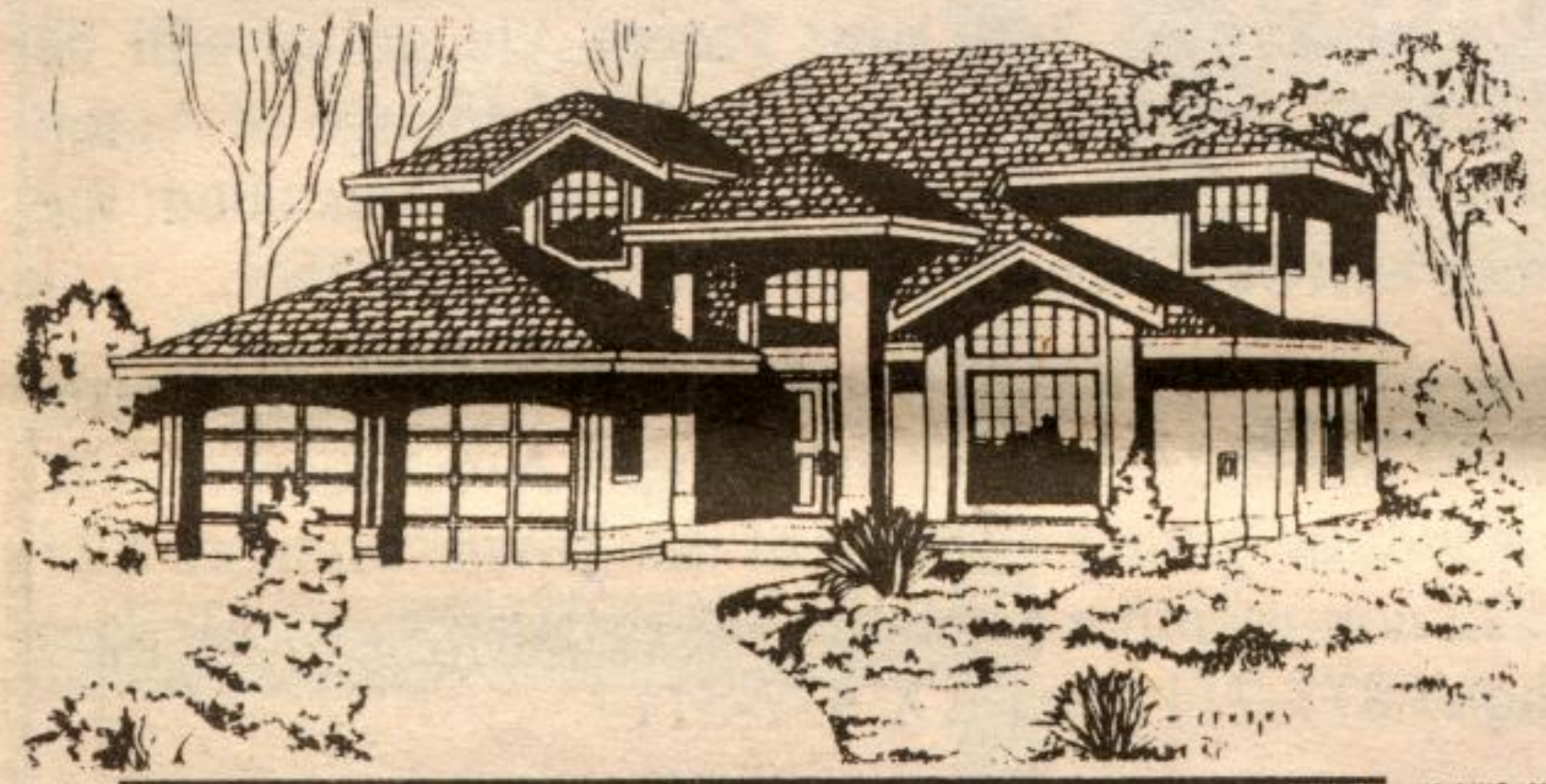
TYMAN DESIGN LTD. 1398 10th Avenue, Ramoth, B.C. Phone: 603-8779 Fax: 603-8979 PLAN NO. U-844 2833 SQ. FT. All plans copyright