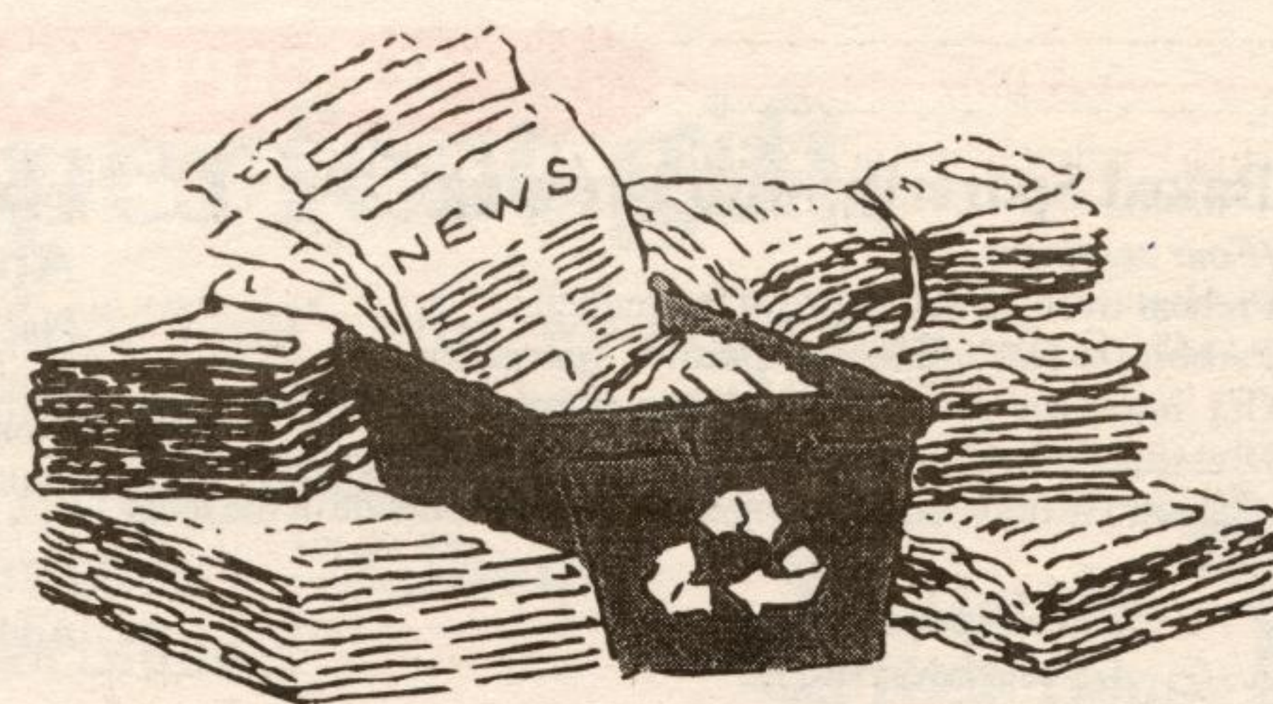
The Newspaper Publishers of Ontario

Recycling newspapers and flyer inserts is a real Ontario success story. Congratulations for your part.