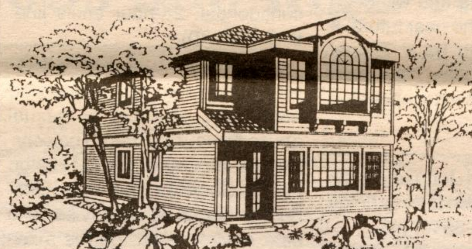
TYNAN DESIGN LTD. 1500 10th Avenue, Surrey, B.C. Phone 881-8725 Fax 881-9573 PLAN NO. GL-624 1624.5 SQ. FT.