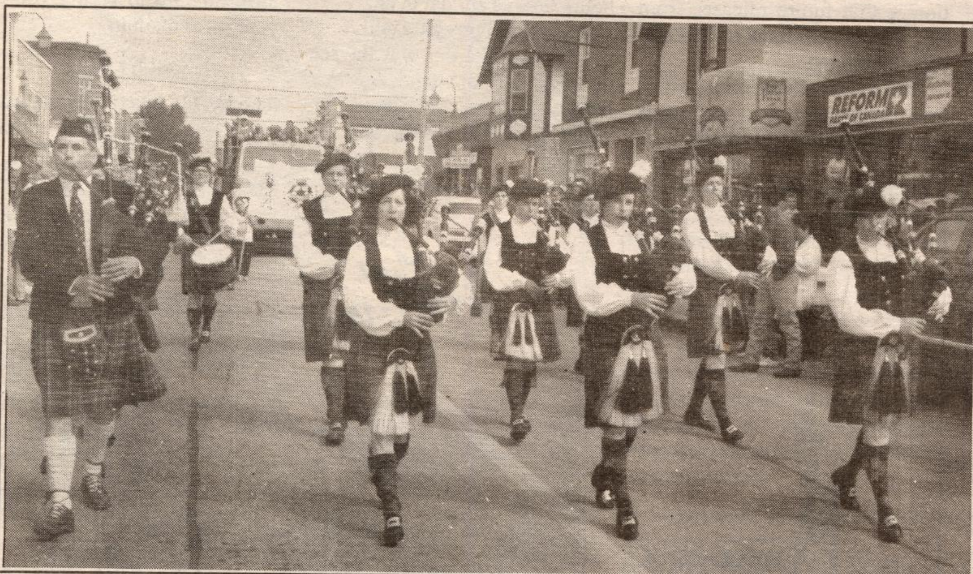
Bagpipes are a perennial favourite with Fall Fair crowds. This band thrilled parade-watchers lined up along Mill Street Saturday afternoon.