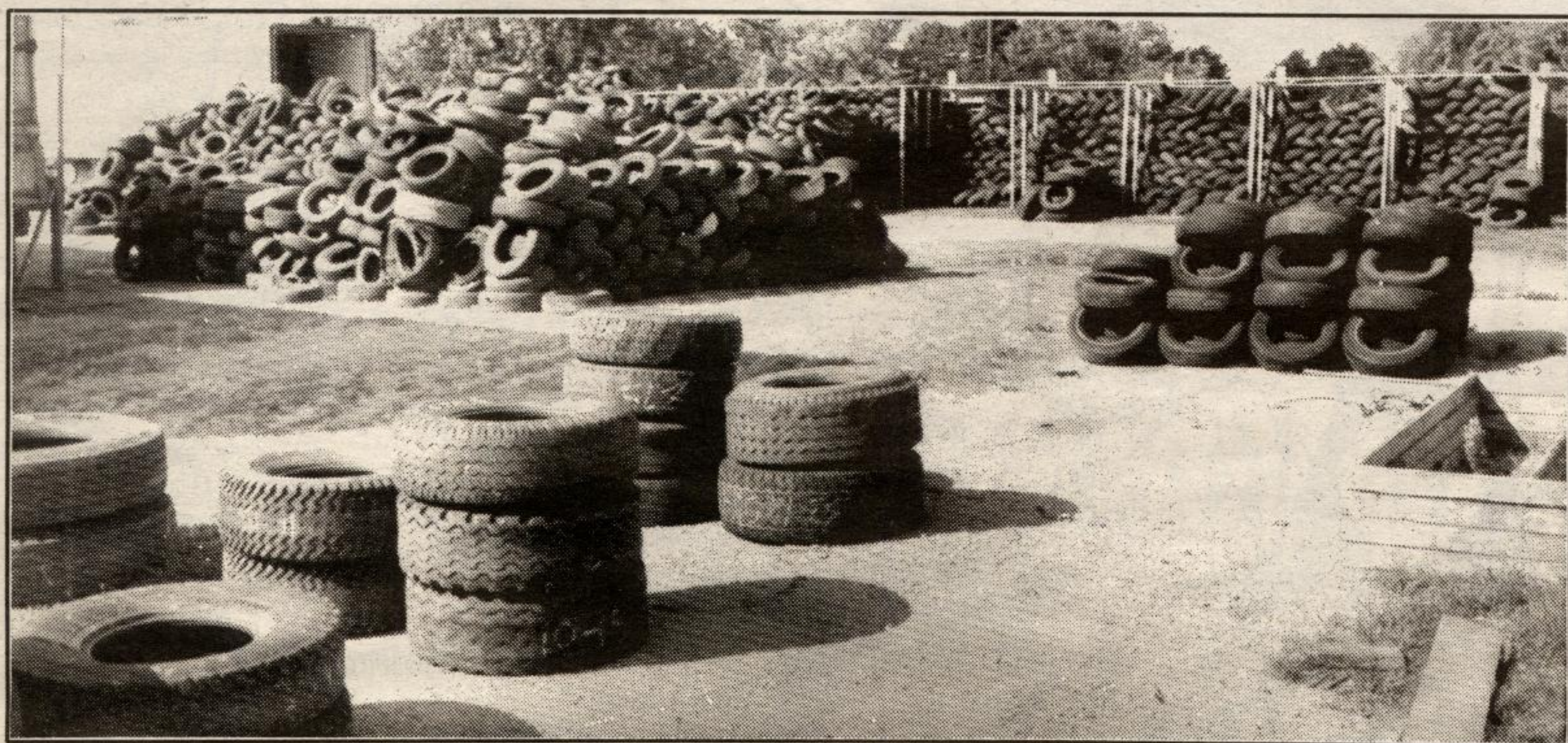
TIRE SALE? These are some of the 4,500 tires on the old Ajax factory site that Council and local residents are concerned about.

"I'm employing local guys and spending money locally. I would like to think I'm doing a service."