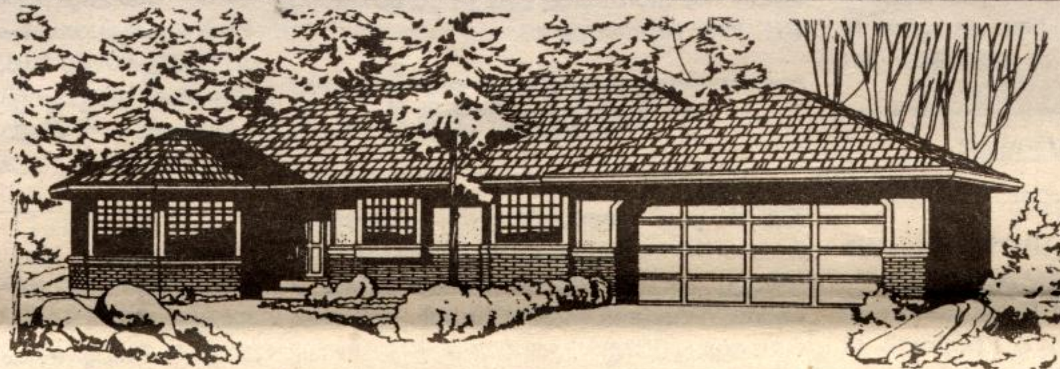
TYNAN DESIGN LTD. PLAN NO. RV-570 2005 SQ.FT. 13600-108th Avenue, Surrey, B.C. All plans copyright Phone 881-8722 Fax 881-8822