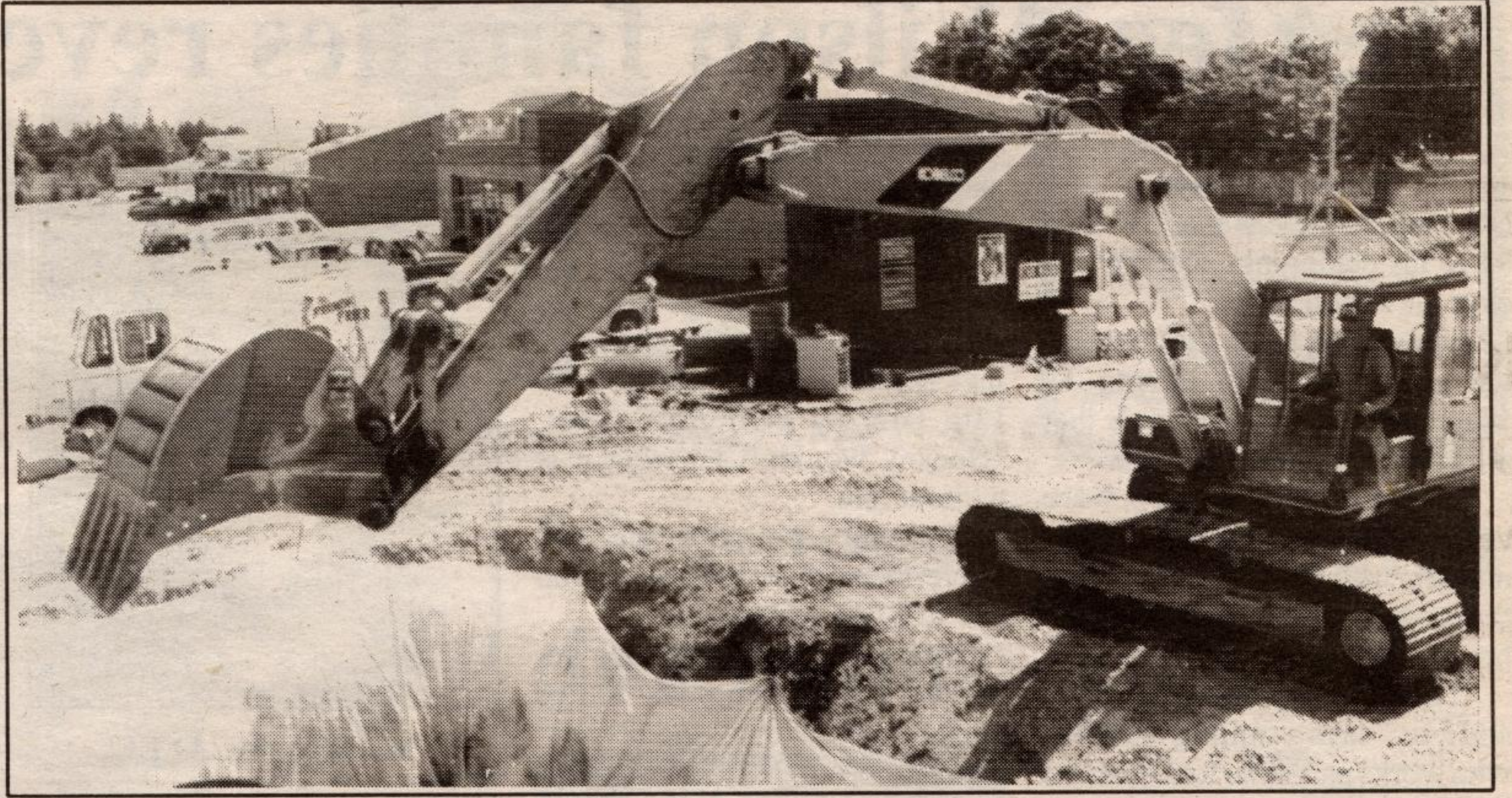
IN WITH THE NEW: Demik Construction of Hamilton was busy on Friday installing three 40,000-litre gas tanks on the old Beaver gas station site. A new Beaver station with a car wash, along with a Tim Hortons, will occupy the site, which is set to be complete by the first week of September.

Classes run from Monday to Friday, 1 to 4 pm. Phone Acton Baptist Church at 853-0690 for more information and get signed up now for the September session.