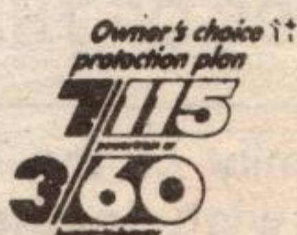
1993 Dodge Caravan/ Plymouth Voyager