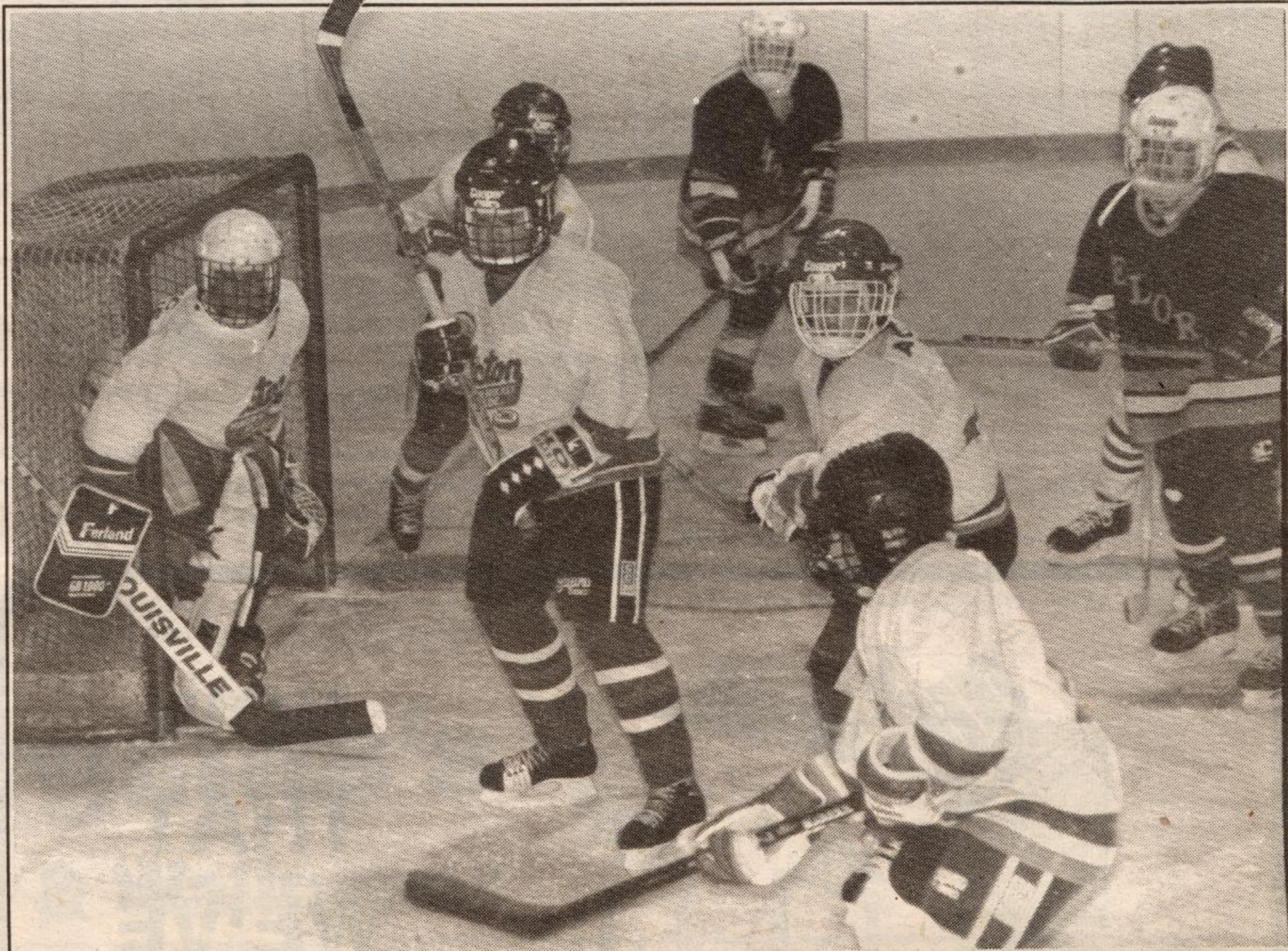
CROWDED SLOT: All eyes are on the puck during the Acton-Elora Peeewe rep hockey match last Wednesday evening at the arena. Unfortunately no score was available at press time, as the game sheet was not submitted. Remember, coaches: it's not only your players who lose out when you forget to submit game sheets... it's your sponsors, too!