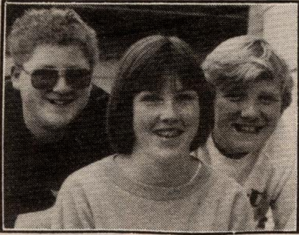
BY MATT SCHILLER, SHANNAN INGLIS & SHAWN BROWN