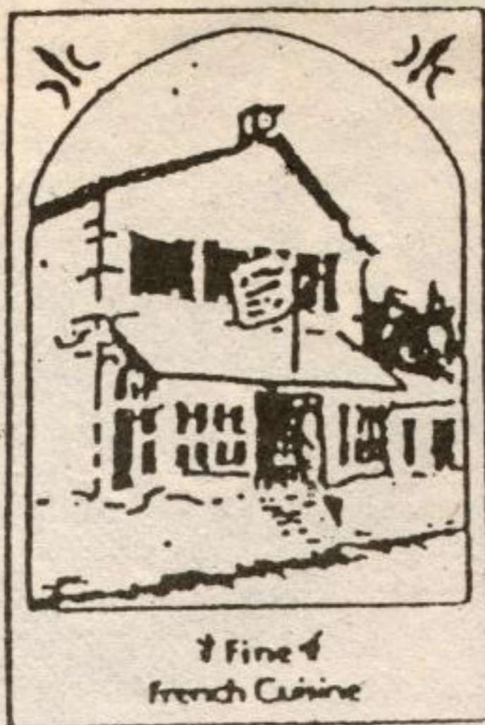
7 Fine of french Cuisine

Sunday, Monday, Tuesday & Wednesday 56 Mill St. E. Acton 853-3020