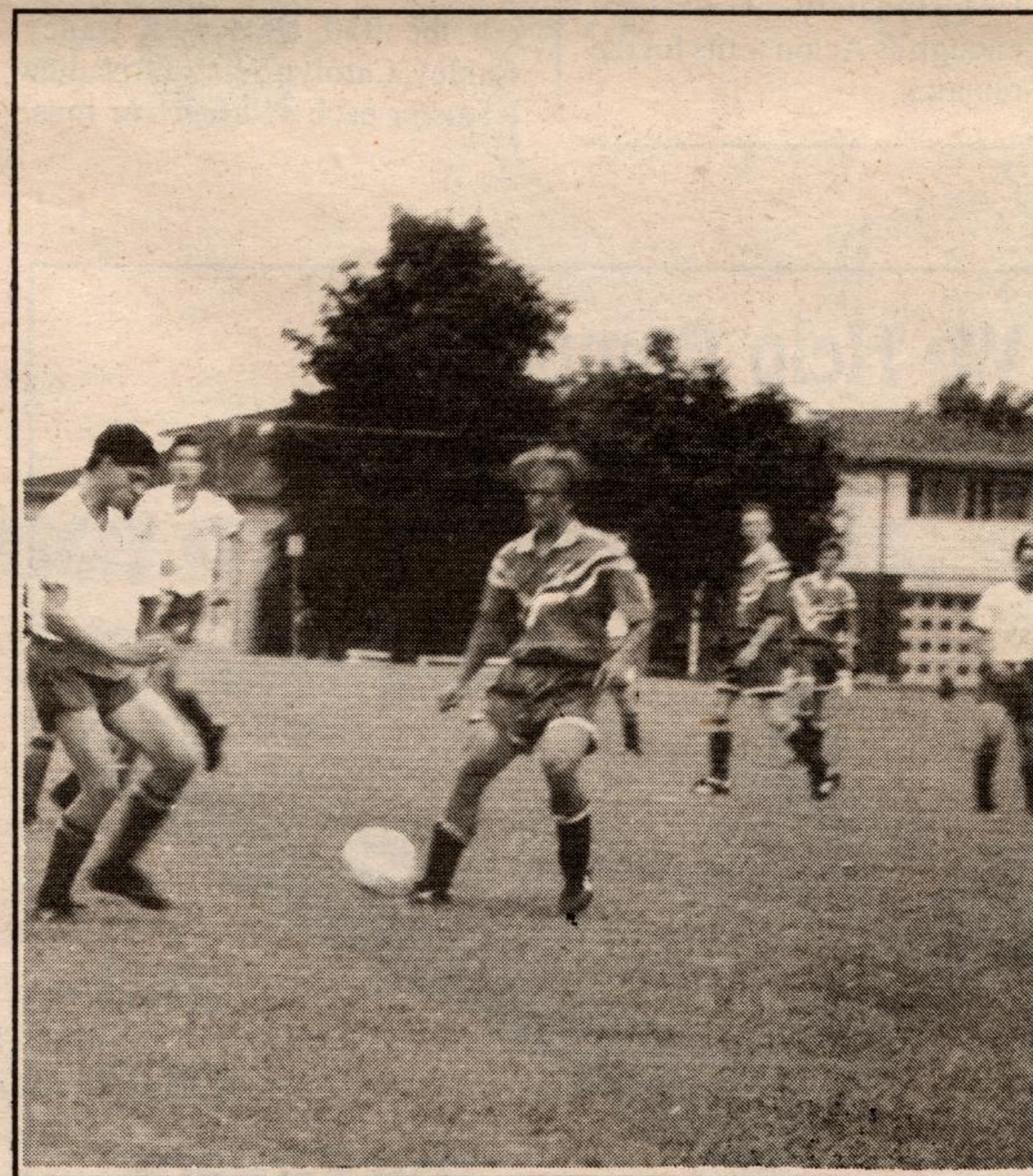
An Acton Under-17 All-Star player (in white jersey) goes in hard after the ball in action against Kincardine on Sunday afternoon at M.Z. Bennett. Acton lost the game 3-0, but further details were unavailable, as a game report was not submitted.