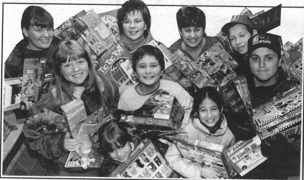
Georgetown's Holy Cross School elementary school teachers and students delivered $1,400 worth of toys to the Love in Christ Foodbank for needy children just before Christmas. They purchased the toys by collecting Canadian Tire coupons.