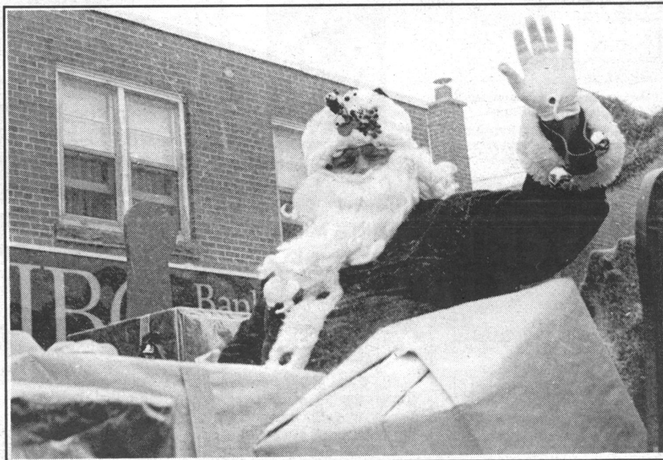
Santa Claus was the main attraction as the annual Acton Firefighters Santa Claus parade wended its way through the centre of town.