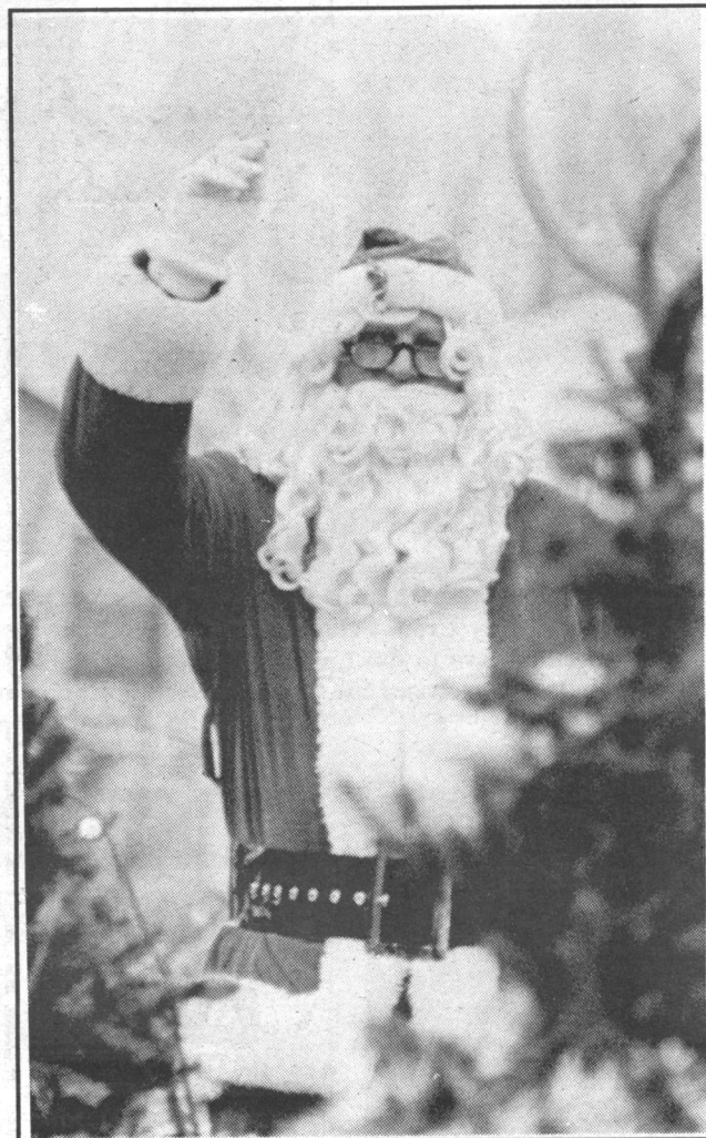
The 62nd Annual Georgetown Lions Club Santa Claus parade was staged despite the wet weather, dispositions were sunny. Santa Claus and his favorite reindeer Rudolph were the stars.