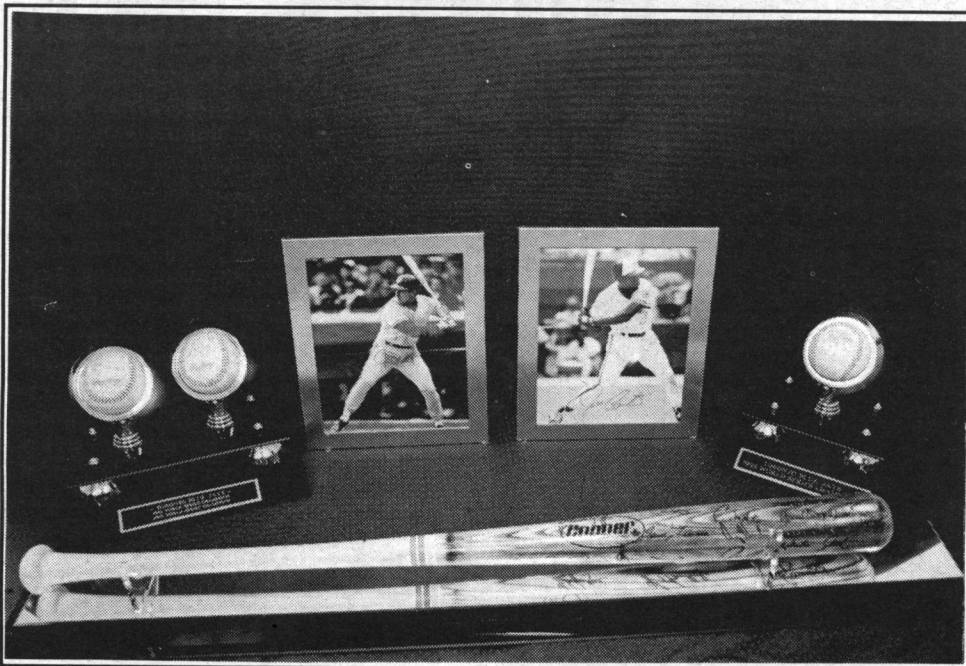
These are the authentic autographed Blue Jays memorabilia available from Baseball Originals. From left to right the 1992 and 1993 World Series balls, framed pictures, 1993 World Series ball and in front a championship bat. Call 905-336-4077 for information.