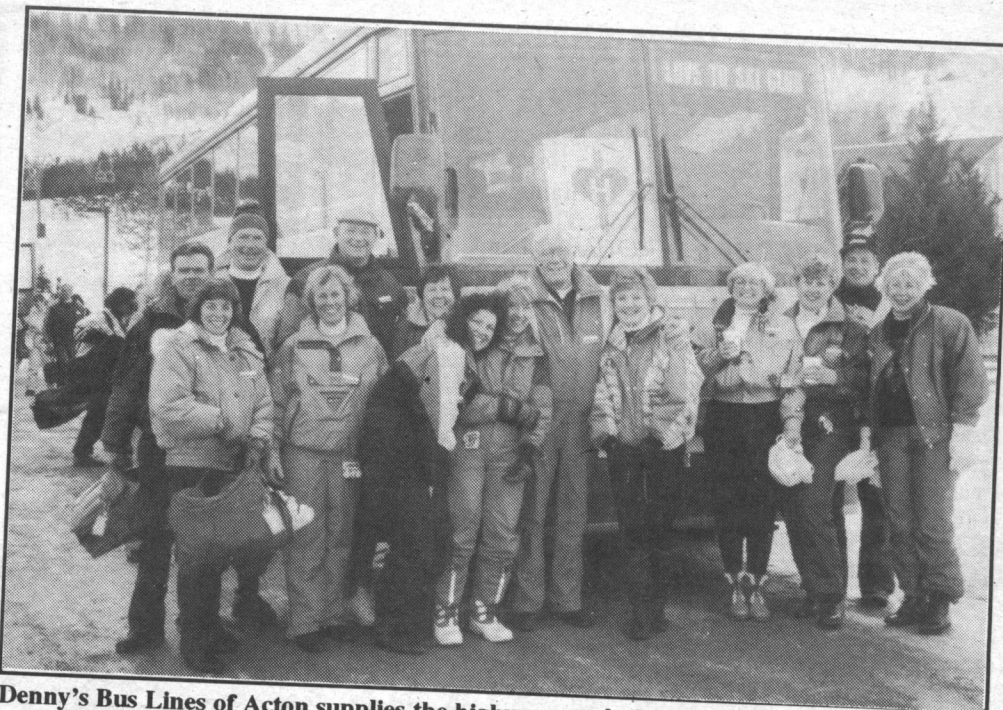
Denny's Bus Lines of Acton supplies the highway coach that transports avid area skiers to both challenging and friendly slopes. The organized ski trips are certainly one way to beat the winter blahs.