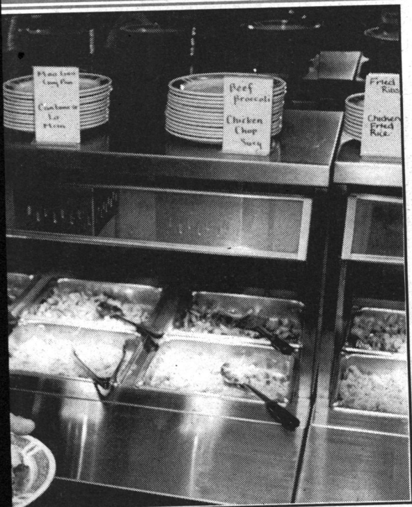
es at his popular Friday evening smorgasbord.