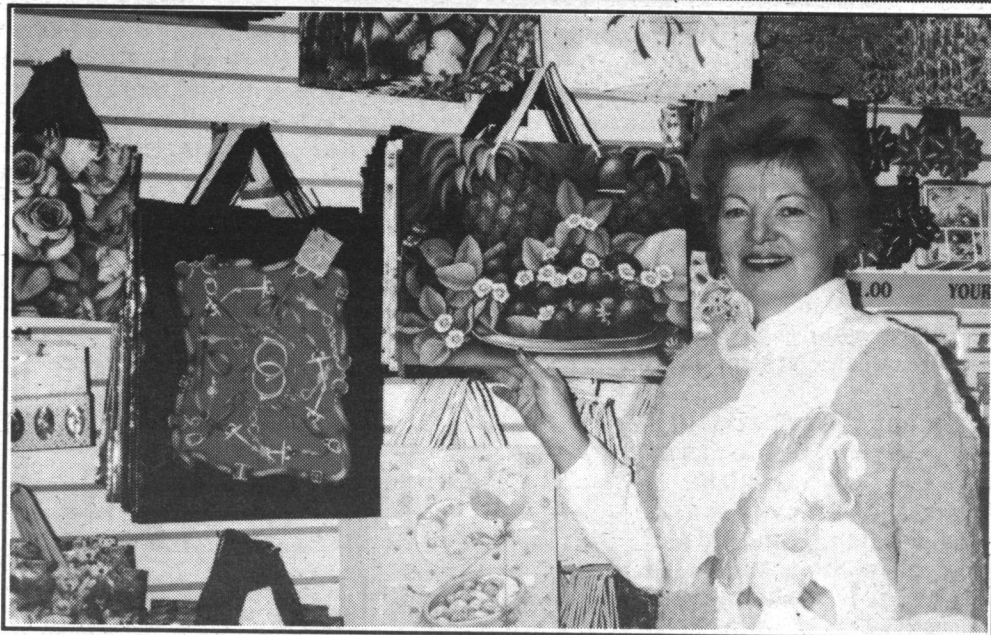
You can wrap it up in a decorative all-occasion bag from the Dollar Plus store located at 99 Main St. South in downtown Georgetown and owner Irma Fahrni will gladly give professional advice for a special occasion bag which will thrill those receiving special treasures.