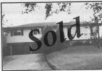
COUNTRY ACRE - 2 FIREPLACES OVERSIZED DOUBLE GARAGE