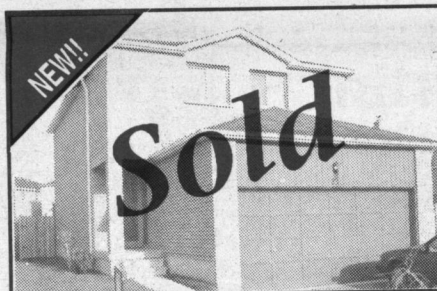
3 BEDROOMS - 3 BATHS! DOUBLE GARAGE $179,900