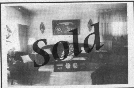
IMMACULATE COUNTRY SQUIRE! 4 BEDROOMS! 2 BATHS!

3 bdrm., eat-in kitchen, bath and living room. Separate 2 bdrm. living room and bath for the inlaws. Plus private family room. New windows, new forced air gas furnace. Immaculate and set on large treed lot. $174,500. Call Brenda Payton*. 93-2-450