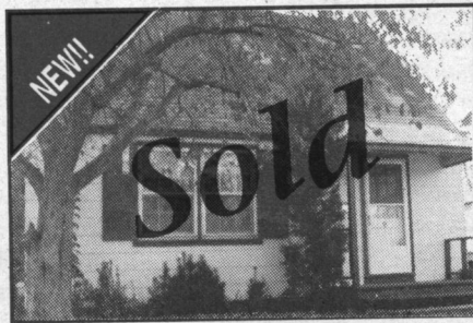
NEW LISTING! $129,900 3 BEDROOMS, GARAGE