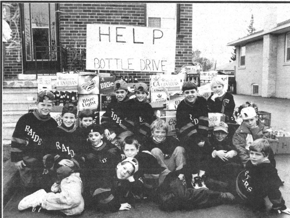
Last Saturday, the Georgetown Beaver Lumber Major Novice Raiders hockey team bottle drive was a great success as the boys worked long and hard, raising money to cover the cost of team jackets and tournament costs.