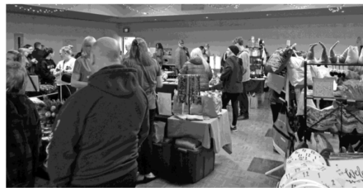
The Acton Legion was a happening place, on Nov 4th, as shoppers got an early start on their Christmas Shopping at the Ladies Auxiliary's Annual Bazaar.