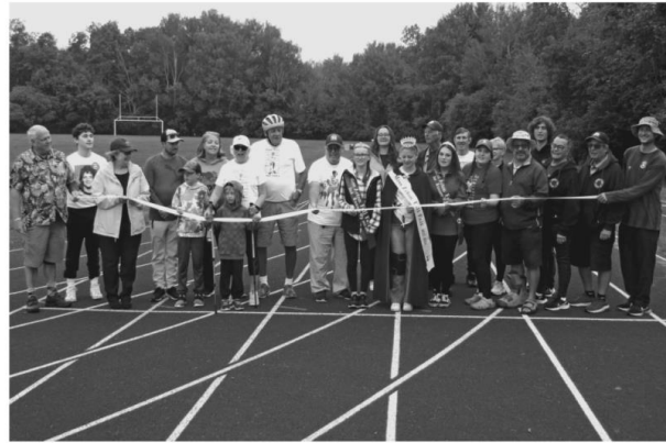
Local dignitaries and community members were on hand for the cutting of the ribbon at Acton's 43rd Annual Terry Fox Run on Sunday, September 17th.

In addition to fundraising pledges for the annual run, funds for the Terry Fox Foundation were raised, on site, through the sale of Terry Fox T-Shirts and a charity barbecue.