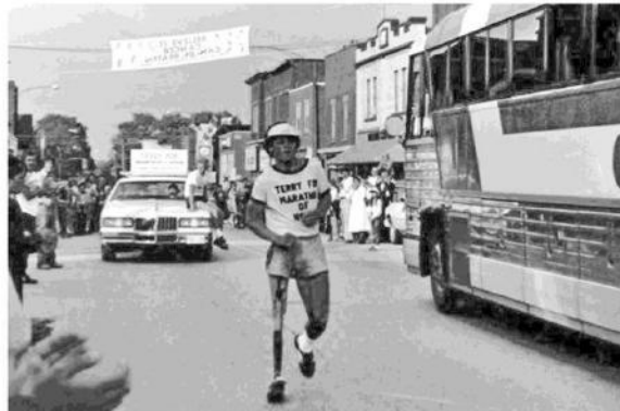
It was on July 23rd, 1980 when Terry Fox came through Acton as part of his Marathon of Hope.