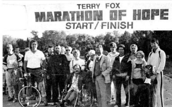
Since Fox's run through Acton, the Terry Fox Run has been held annually in Acton, as seen in this photo from September 1982.