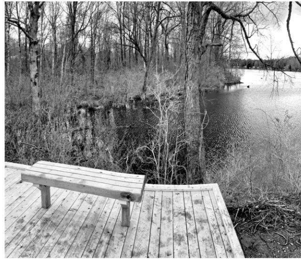
The new wooden outlook as seen along the shore of Fairy Lake.

The walking trail project was approved as part of the 2022 Capital Budget, with an allocation of $90,000 for construction of the trail.