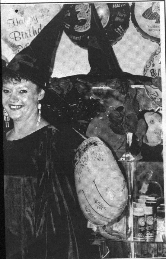
our favourite witch's costume and hams it up with costumes are available...book early!

AWAY BALLOONS 90 Main Street Downtown Georgetown 873-2334