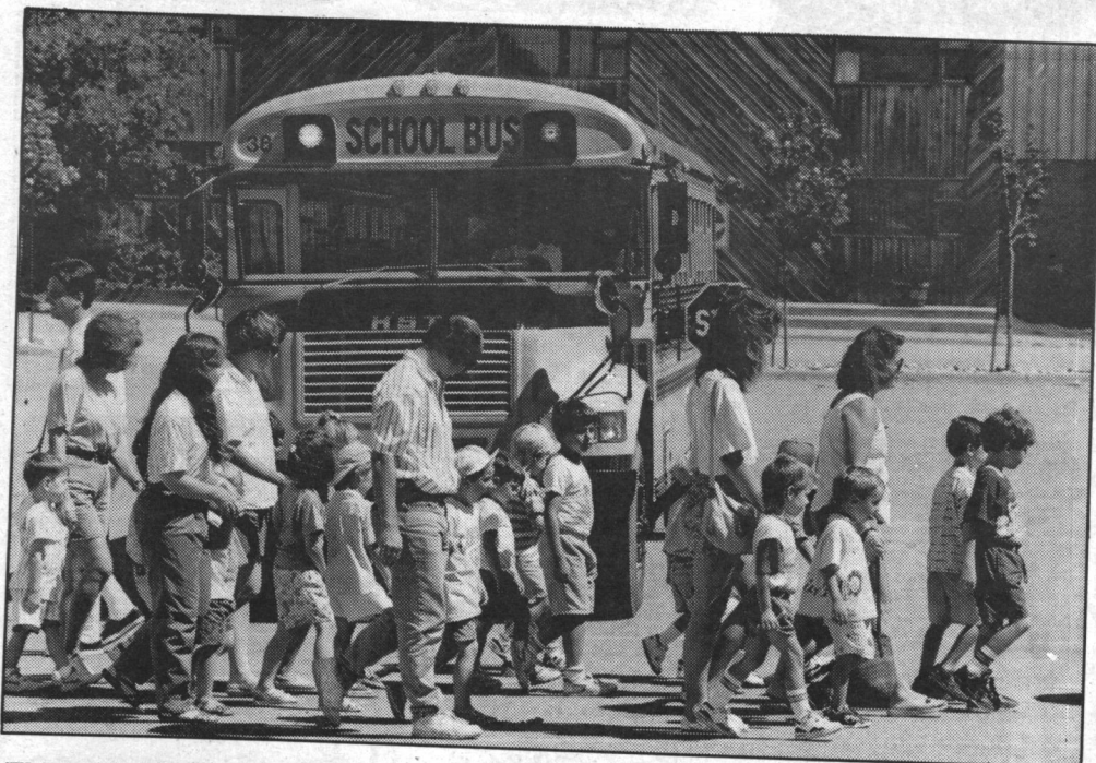
Think, Think, Think Safety! Halton Bus Safety Committee held its annual school bus orientation for toddlers going to kindergarten last Saturday at Georgetown District High School. Children and their parents watched a video on safety then went for a bus ride to the Go Station parking lot to practice getting on and off the bus safely.