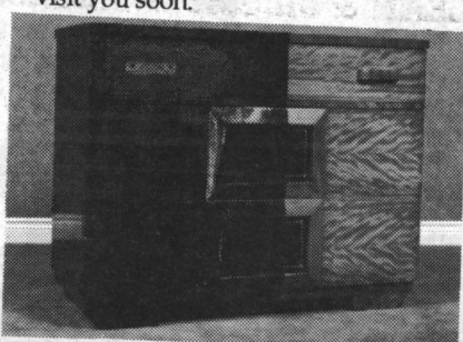
BEFORE - AFTER CUSTOM REFINISHING