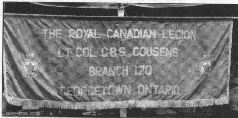
Saturday's 2nd annual Georgetown Branch 120 Royal Canadian Legion track and field meet was hailed by organizers, competitors and parents alike as a tremendous success, with upwards of 260 youngsters participating.