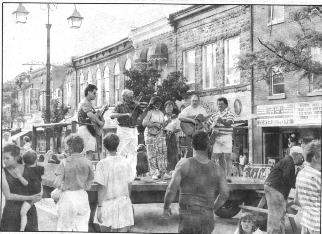
At '92 Pioneer Days the community was treated to a singalong en Français with the members of the Sacré Coeur Church.