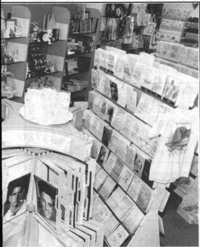
added to her display at her Main Street gift store

Picture frames made in Italy in various sizes are available as well as those in brass, silver and pewter.