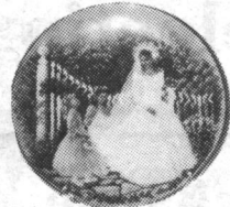
"The Bride & Her Helpers"

Montgomery'S of Georgetown Introduces... a new expanded selection of collector plates