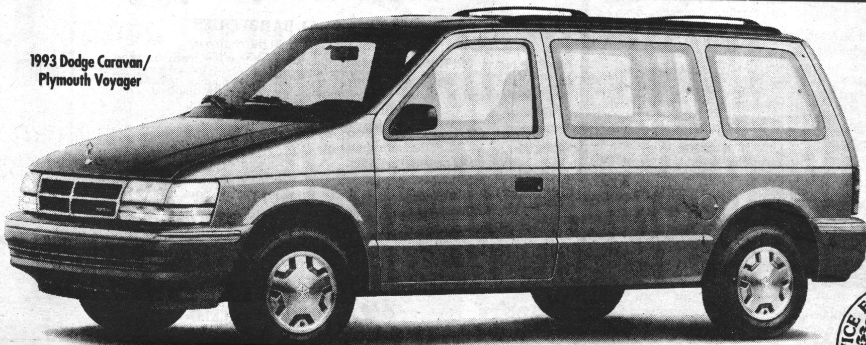
1993 Dodge Caravan/ Plymouth Voyager