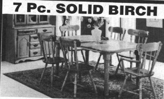
Table and 6 chairs, 2 leaves built to last forever. Just come and view the quality of this Canadian Made Suite.