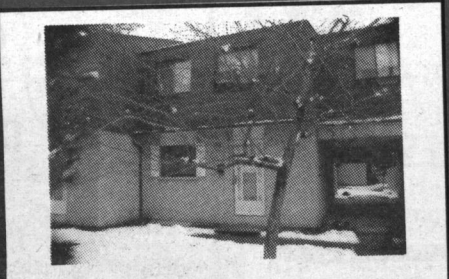
SOLD for Debbie