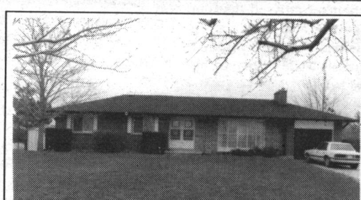
Vendor Says "Sell!" Country Bungalow

Investment opportunity - 4 - one bedroom living units, previously rented at $520./month each. Less than an hour from Georgetown. Now Only $84,000.00 Call: Andy King** at 873-1702 (res.) or 454-0446 (tor.)