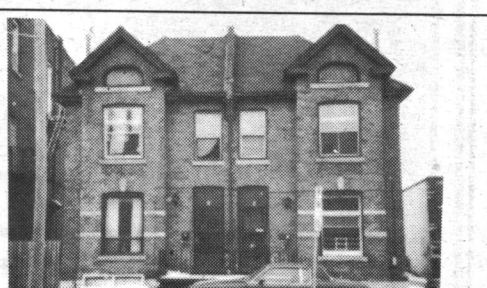
Major Clean Up Needed! Under Power of Sale!

Featuring: 3 bedrooms, eat-in kitchen, 4 piece & 3 piece baths, extra kitchen in basement, detached garage, wood burning stove, extra large lot and more. Offered at $156,900.00 Call: Andy King** at 873-1702 (res.) or 454-0446 (tor.)