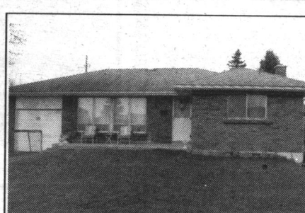
Brick Bungalow with Garage

not intended to solicit homes already listed