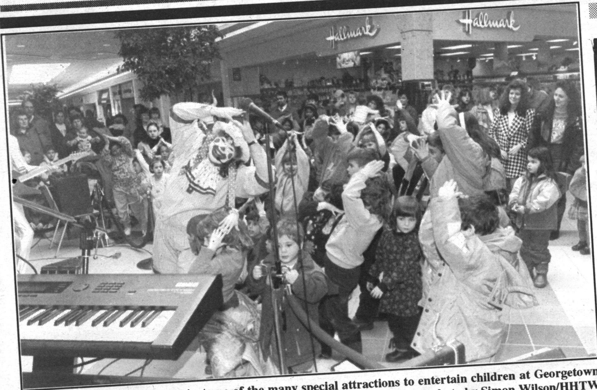
The Sphere Clown Band was just one of the many special attractions to entertain children at Georgetown Marketplace over the recent March break.