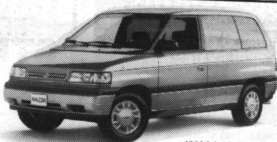
1993 Mazda MPV