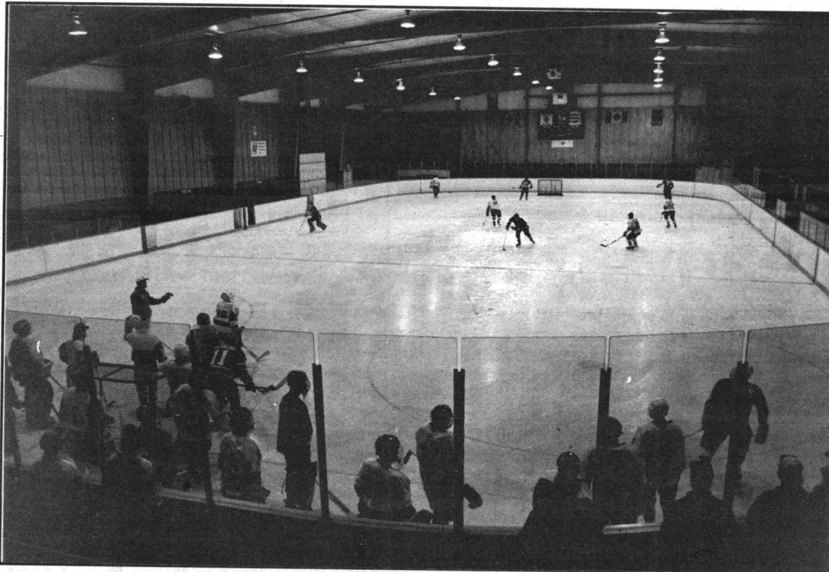
It was work, work and more work, (and little time for a breather) as Georgetown Chrysler Raiders brass checked out possible prospects at a three-night rookie tryout camp which got underway Tuesday night at Gordon Alcott Memorial Arena.