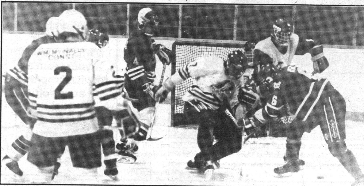
The first session of the Georgetown Chrysler Raiders rookie tryout camp at Gordon Alcott Arena on Tuesday attracted roughly 80 junior hockey hopefuls, in a rough and tough, skating, shooting and scrimmage session.