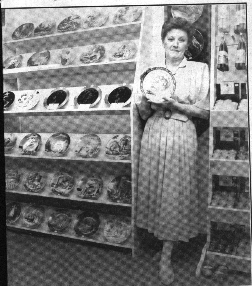
her collection of fine collector plates.

Montgomery's of Georgetown is pleased to announce the introduction of a personal body care line of 100% Canadian-made natural products that are not tested on animals. They will be expanding on this line over the next few months.