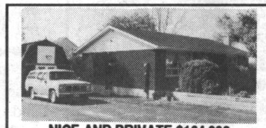
NICE AND PRIVATE $164,900

3 bedroom raised bungalow. Private location, convenient to Village centre. Main floor: country kitchen, living, bedrooms and bathroom. Lower level: rec room with walkout, bathroom, laundry, storage. Quiet street. Lots of big trees. $209,000. John Bloss* 856-4348/856-4527. RMRW93-07