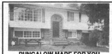
BUNGALOW MADE FOR YOU

Winter retreat in the Caribbean. Within a strong Canadian/American Community. Complete with all rattan furnishings. Can be rented for investment income. Vendor will cover air-return for two on completion of inspection and purchase. $199,900. Call for details. John Bloss* 856-4784/856-4527. RMRW92-27