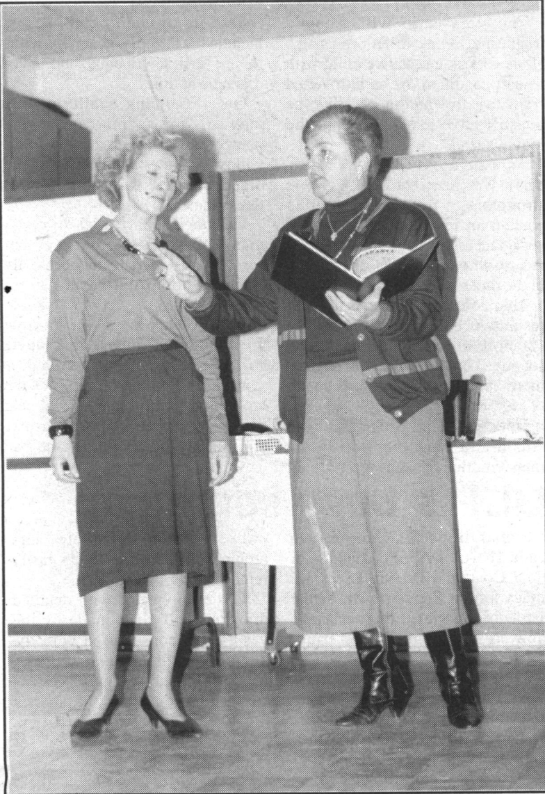
Georgetown models were strutting their stuff at Knox Presbyterian Church, Friday as the Halton's Pride #393 of the Loyal True Blue Association presented their 4th annual fashion show. Funds raised from the show go to support diabetes research at the Loyal True blue and Orange Home in Richmond Hill.