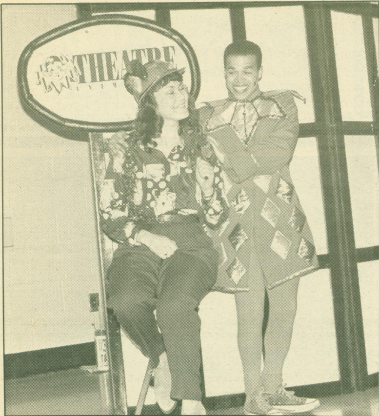
Harrison Public School enjoyed a visit by Theatre Animation, a group specializing in educational entertainment, Thursday morning. The children were enchanted by the Toronto company's performance of Jacky and the Beanstalk.

Fans of Dracula movies will not be disappointed in the Coppola version of the classic as there is a requisite amount of neck champing (good sound effects) and flashing canine incisors.