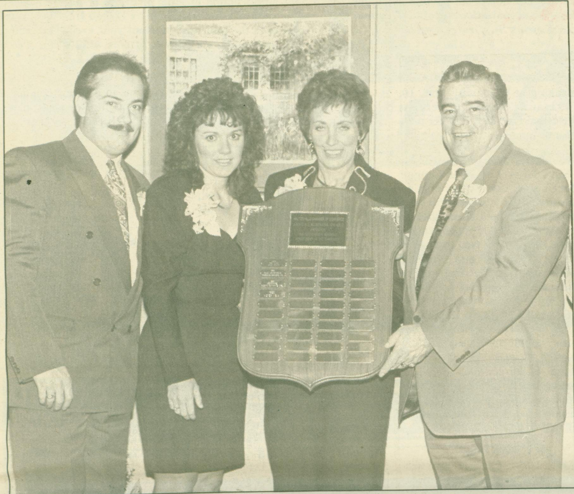
The Halton Hills Chamber of Commerce 1992 Business Award ~ Acton I.G.A.