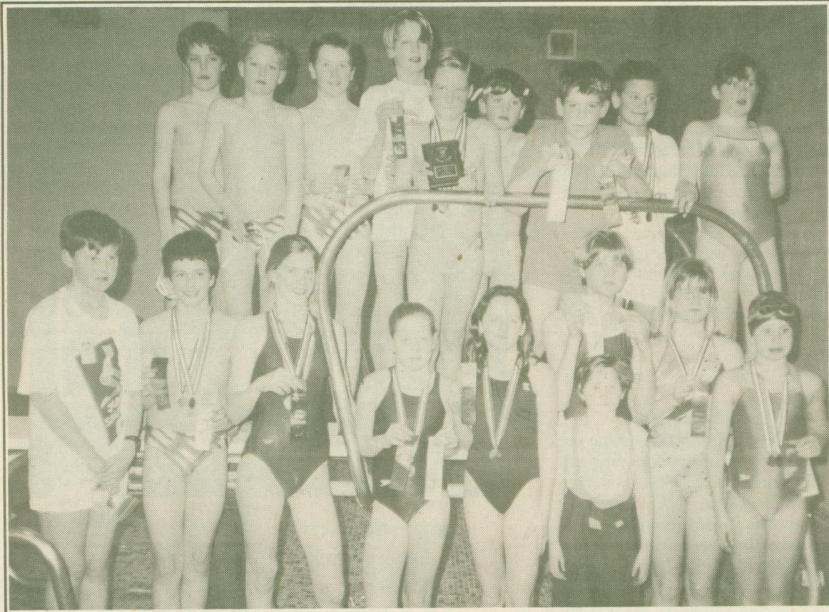
Pictured above are members of the Halton Hills Blue Fins who attended the Cobra Winter Invitational Swim Meet last week. Twenty-six Blue Fins attended the meet along with swimmers from six other clubs setting 83 personal best times, bringing home medals and ribbons.