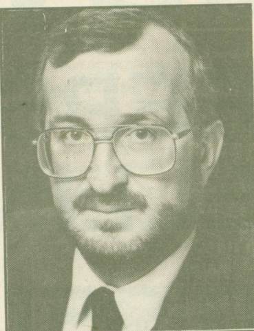
Noel Duignan MPP Halton North

By now I'm sure you've heard the news about the jobsOntario Capital funding for area transportation improvements and for the construction of the Glen Williams water main. These projects are important elements in our overall plan to correct our "infrastructure deficit". For too long, investment in our transportation and communication systems, and water lines and sewers has just not been good enough.