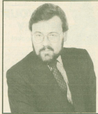
Garth Turner MP Halton-Peel

Well, I sit in my seat, and I listen to both sides, and I wish we could have a better system. I know when I drive around Halton-Peel that there is good, and there is bad. Life is not lived in absolutes. People