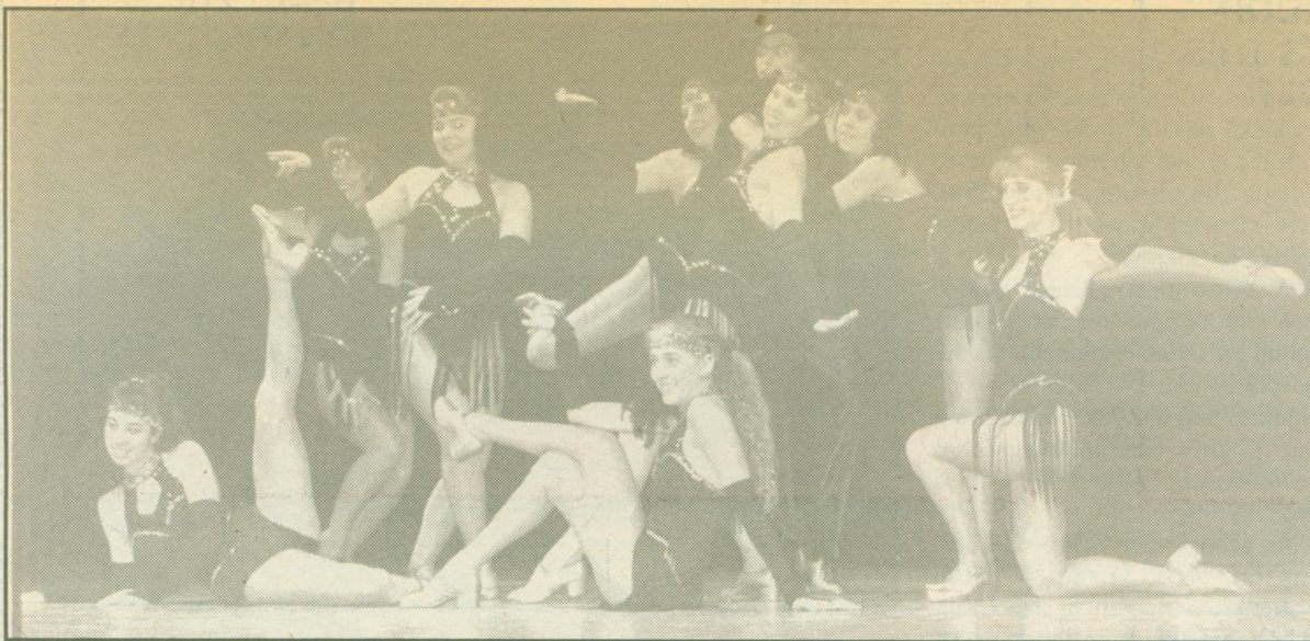
The Cheri Lindsay Dancers entertained at the Municipal Awards Evening last Wednesday, as well as receiving an award for Creative and Performing Arts. They achieved 2nd place at the Canadian Dance Teachers Association Competition.

The Town of Halton Hills Municipal Awards were awarded last Wednesday, honoring Halton Hills citizens of distinction in athletics and culture. Halton Hills is the home of two Olympic athletes, many distinguished artists and many national and international medalists.