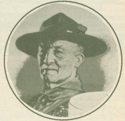
Lord Baden Powell

1st Hornby and 1st Ashgrove - Feb. 21st at St. Stephen's